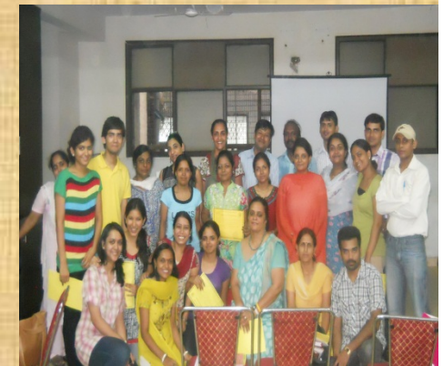
Some of the attendees