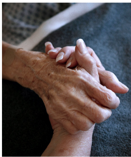
THE COMFORT OF A HELPING HAND...

However, times have changed drastically and the "nuclear family" is here to stay. More often than not