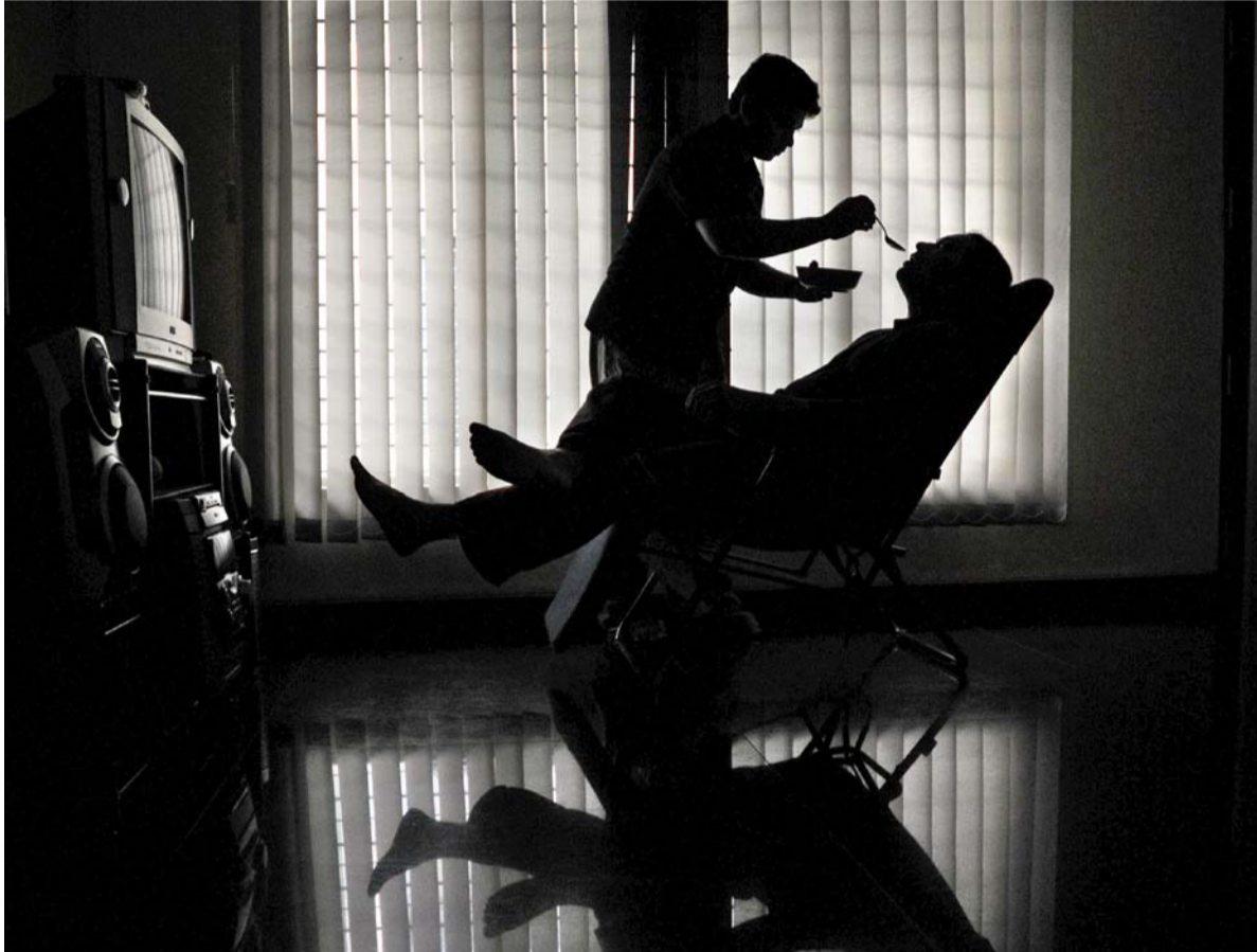
IT IS POSSIBLE TO EASE UNNECESSARY PAIN...

Palliative Medicine is a specialty which involves the active treatment of patients undergoing chronic and life limiting illnesses. Palliative care is not just terminal care. The main focus is on